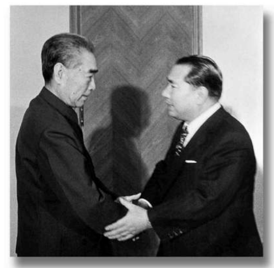
Meeting Chinese Premier Zhou Enlai (Beijing, December 1974)