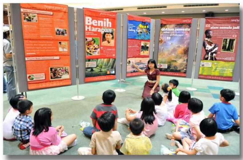
The "Seeds of Hope" exhibition jointly created by the SGI and the Earth Charter International (Malaysia, 2012)