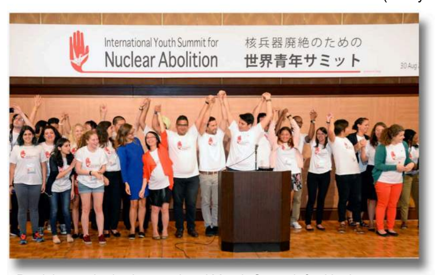
Participants in the International Youth Summit for Nuclear Abolition (Hiroshima, August 2015)